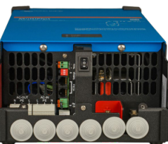
MultiPlus 2000 VA (bottom cover removed)